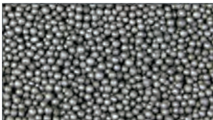
Carbide Cemented carbide